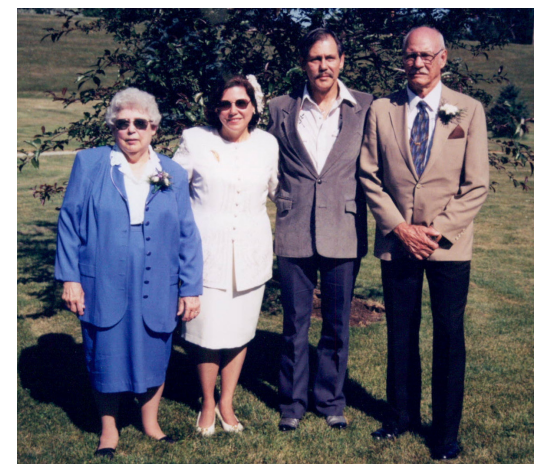
Mom, myself, my brother, and my father taken at my wedding in 1999.